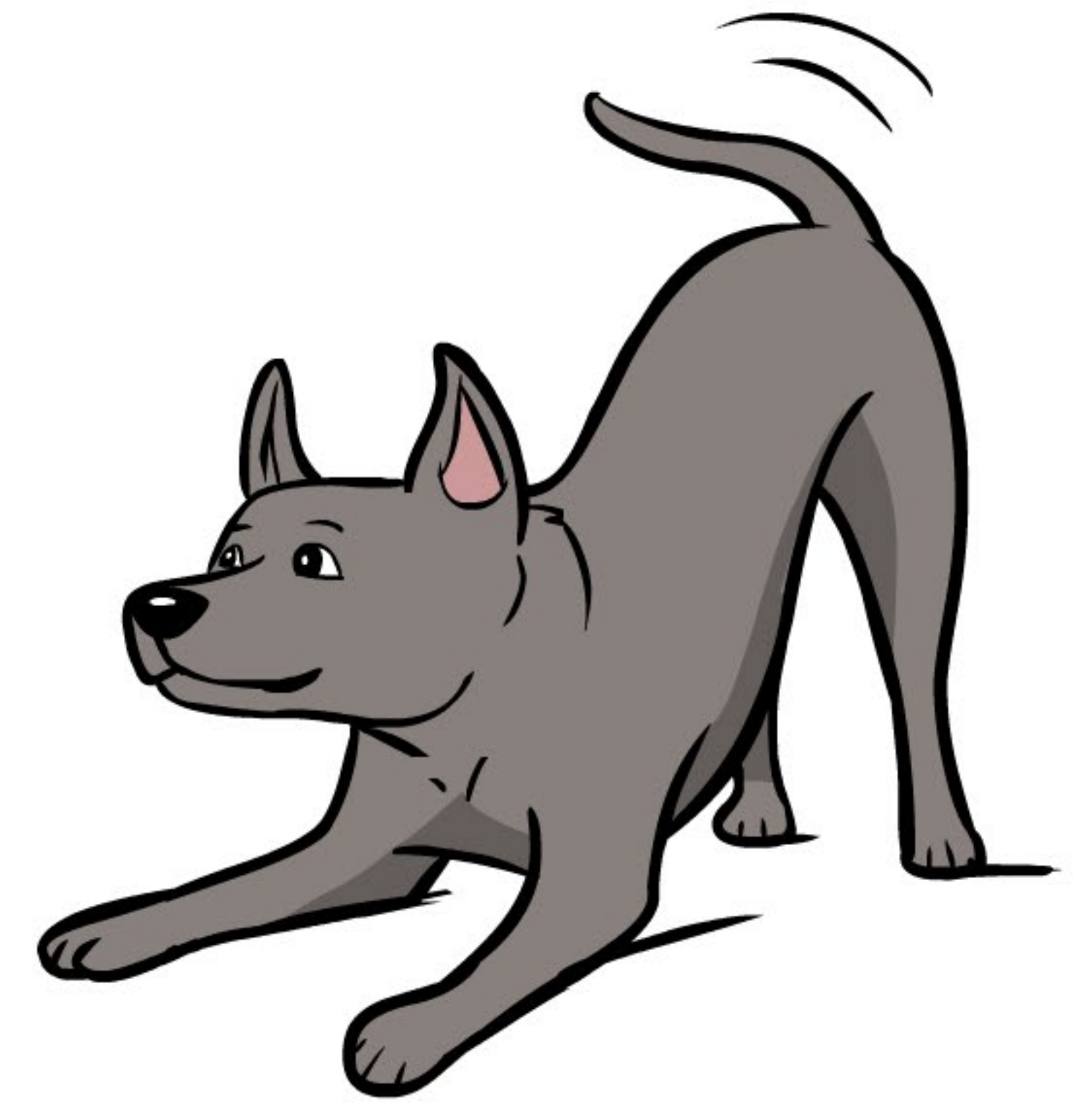
Playful: excited playbow