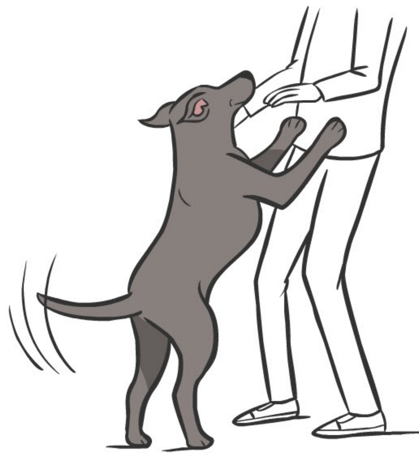
Jumping on people