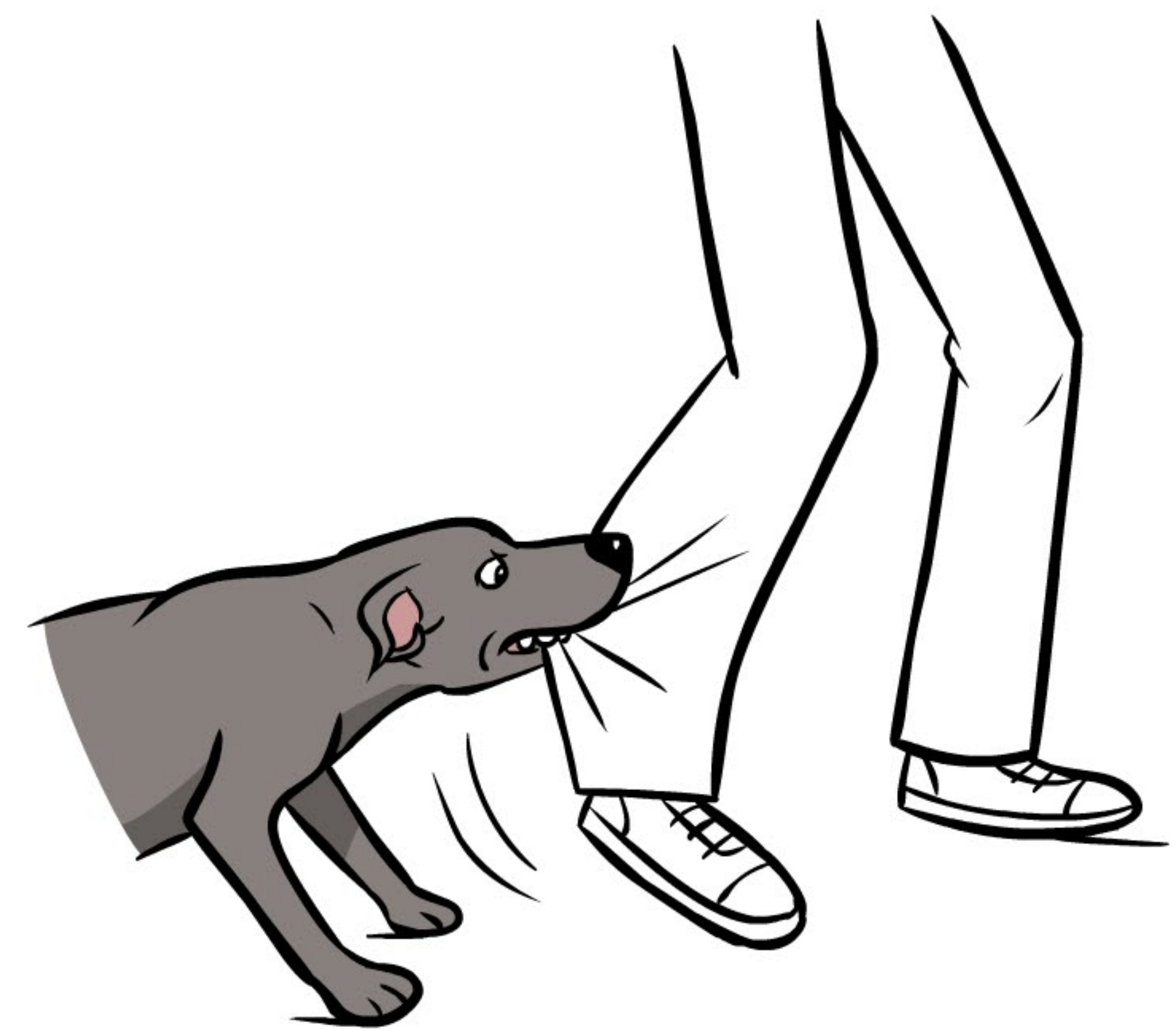
Biting or tugging clothes