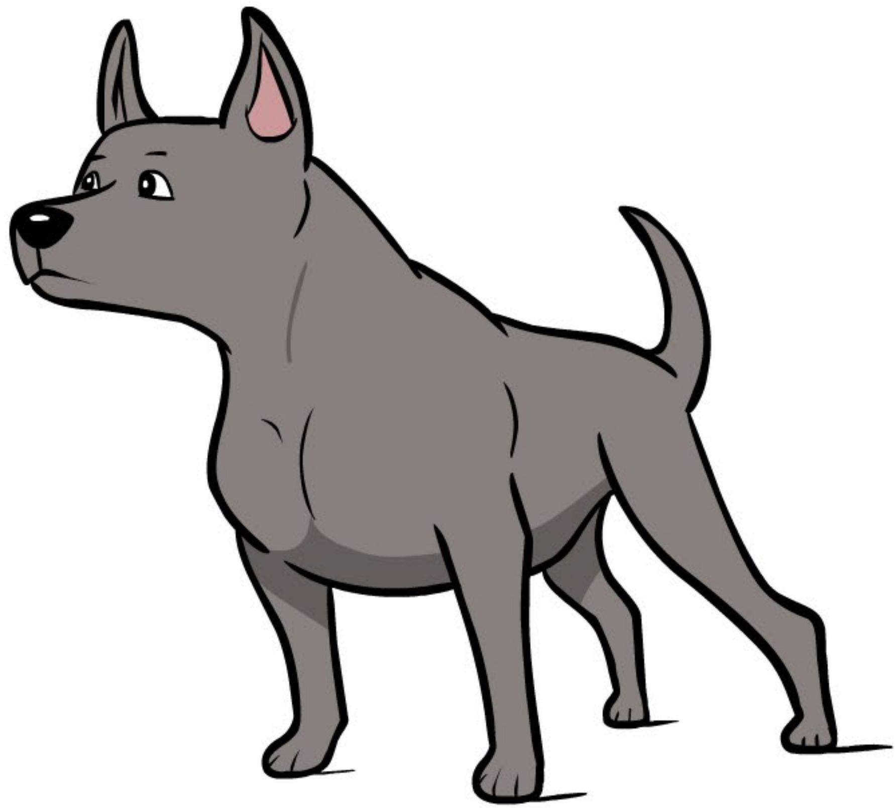
Body forward, ears forward, high tail: alert/aroused

These body language signals indicate that a dog may be aroused or excited